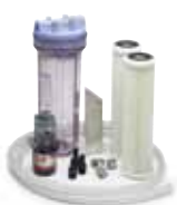
Silt Reduction Kit

For waters with high levels of suspended matter, e.g. in shallow anchorage, we would recommend you use an additional prefilter. This additional filter is finer (5 microns - 1 micron = 0.001 mm) than the standard filter (30 microns) and is placed after it. A booster water pump (12V/0.8 A/h) is also provided. This pump compensates for the loss through the second filter and increases water production. We would also recommend the prefilter kit when the PowerSurvivor is not installed under the water line and when it is in constant use to increase the intervals between servicing.